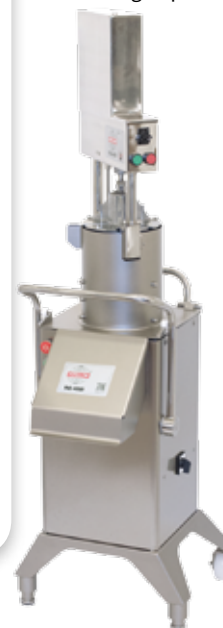
RG-400i with Pneumatic Push Feeder