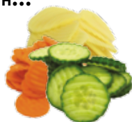
Cut crimping slices