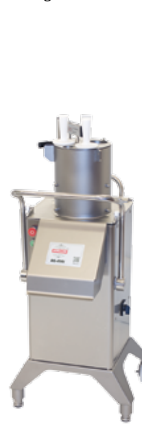
RG-400i with 4-tube insert