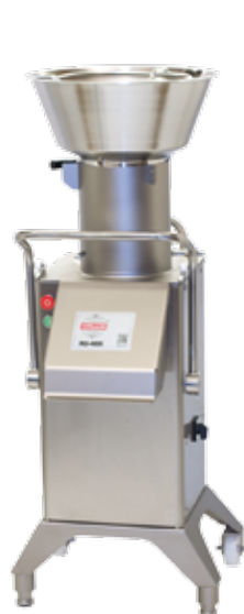
RG-400i with Feed Hopper

Feed Cylinder B with one internal wall is used for the Pneumatic Push Feeder, Manual Feeder and 4-tube insert. It is optimal for manually orienting of products, stacking.