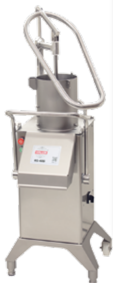
RG-400i with Manual Push Feeder